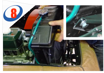
A. Carefully lower the assembly into position in the engine bay. The two lower bolts must be in front of the lower brackets as you do this.

C. Remove the pre-cut ears with a knife to allow the fan casing to fit snugly between the radiator edge mounting panels.