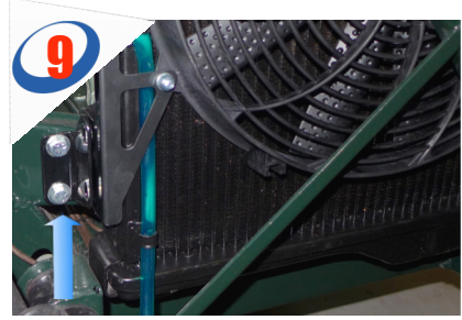
A. Undo the lower bolts and pivot the radiator back into position.

DO NOT over-tighten the bolts or the casing might be damaged.