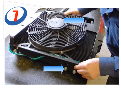
A. Fit the fan assembly to the radiator by slotting it into position.

bolts and use copper grease on the theads when reassembling later.