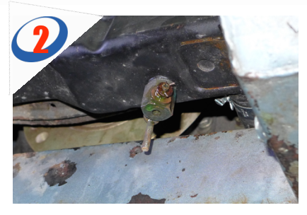
A. Disconnect the battery.

TIP: Fit the bolts without washers first to make locating the bracket slots easier.