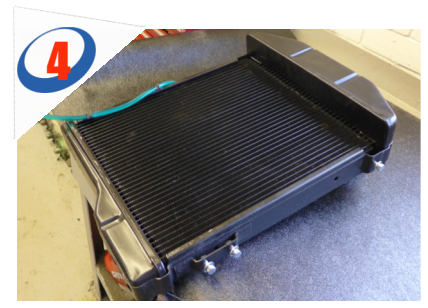
A. Working on a bench, ensure all six mounting bolts move freely. TIP: If necessary, renew the mounting

B. Consider renewing the hose to be fitted with the Revotec Electronic Fan Controller (EFC) if it is appears old, shows signs of cracking or feels inflexible.