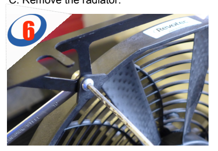
Fit the mounting brackets to the fan casing using a 10mm spanner or socket and 4mm Allen key.

B. If desired, now remove the mechanical fan by unbolting the four bolts securing it. C. Remove the radiator